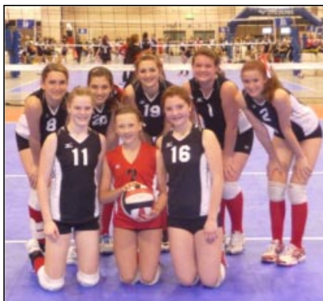
IPVA 14 Red